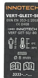
Produkt sticker incl.: Product name, standard, CE-no., batch no.

conforms with the provisions of regulation 2016/425 and with standards DIN EN 353-1:2018 and EN 365:2004 , which were the object of the type test with (type) test no.: 2097-2011-PSA20-072-Z , performed by the following testing authority: