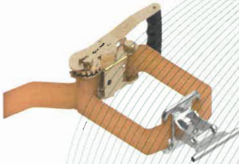
Fig 3: Intermediate anchor type: TEMP-SZH-10