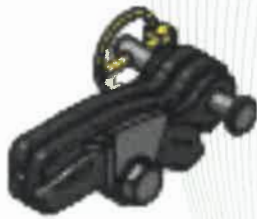
Fig. 4: Endlock, type: TEMP-ENDS-10