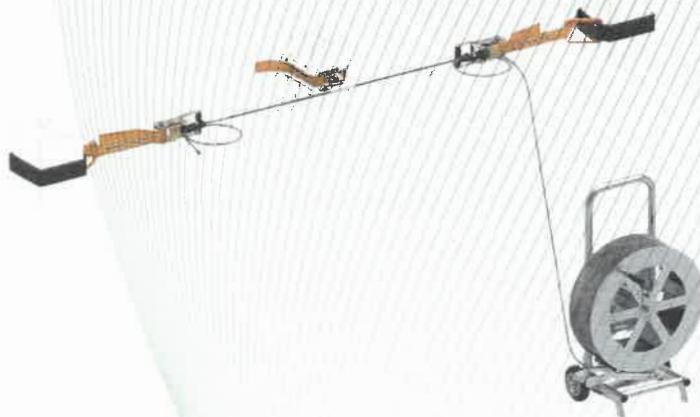
Fig. 1: Anchor device, type: TEMP

The metallic components of the anchor device are made of corrosion-resistant steel.