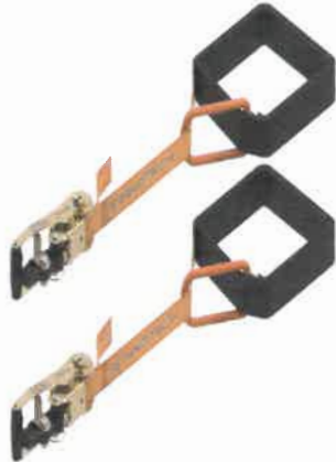
Fig 2: End anchor points with strap and ratchet