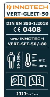
Produkt sticker incl.: Product name, standard, CE-no., batch no.

conforms with the provisions of regulation 2016/425 and with standards DIN EN 353-1:2018 and EN 365:2004 , which were the object of the type test with (type) test no.: 2993-2511-PSA25-136-Z , performed by the following testing authority: